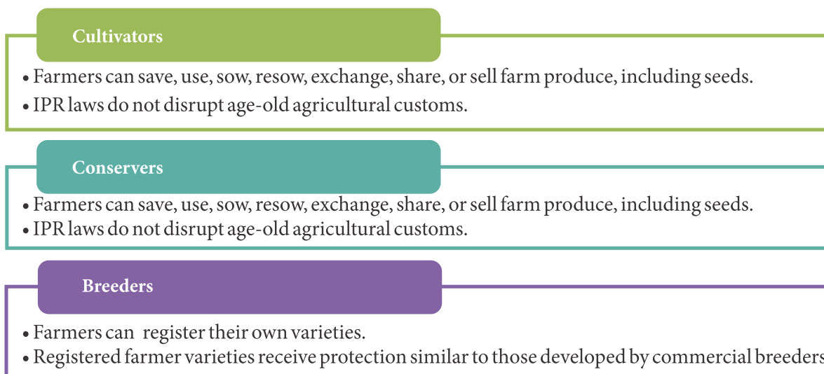
Chart No. 2.