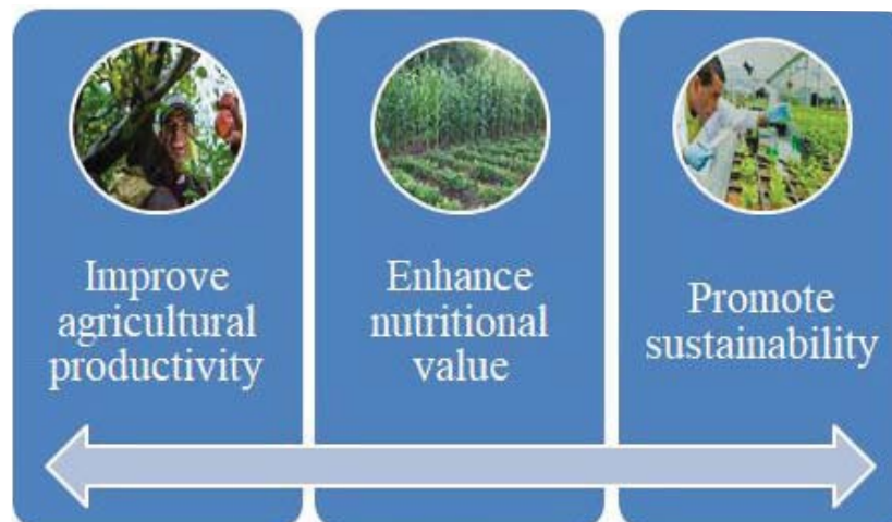
Chart No 1

breeders, often at the cost of traditional farming practices 2 . Farmers, who have historically conserved, improved, and shared seeds, risk losing autonomy under stringent IPR regimes 3 . India's response to this challenge came in the form of the PPVFR Act, 2001, which attempts to strike a balance between protecting breeders' innovations and safeguarding farmers' rights. Unlike many international regimes, this Act explicitly recognizes farmers as cultivators, conservers, and breeders. This paper explores whether the PPVFR Act effectively achieves this balance, especially in the context of rapidly evolving agricultural biotechnology 4 . It developed the following initiatives-